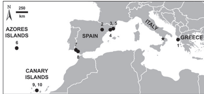
Fig. 1. Distribution of Paspalum notatum in Europe (including Azores and Canary Islands) with the first Italian record (star) and previous reports (circles: 1 – Scholz 2002; 2 – Pyke 2003; 3 – Verloove 2003; 4 – Verloove 2005; 5 – Böhring and Scholz 2004; 6 – Silva et al. 2005; 7 – Sánchez Gullón et al. 2006; 8 – Valdés et al. 2007; 9 – Verloove and Reyes-Betancort 2011; 10 – Siverio Núñez et al. 2013).

Typus: Argentina, Entre Ríos: Concepción del Uruguay, L. R. Parodi 12670, January 1937; holotypus in BAA, isotypus in US-1721333!