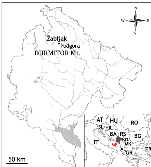
Fig. 1. Location of the investigated area in Montenegro and its position in SE Europe.

Tepačke Forest belongs to the Durmitor mountain range and covers a plateau northwest from the town of Žabljak (Fig. 1). The area is dominated by forest vegetation. The collection site for the two moss species described in this paper is located in the zone of coniferous forests from the association Piceo abietis–Pinetum sylvestris Stefanović 1960. The floristic composition of the community is characterized by the following: edificators in the tree layer ( Picea abies (L.) H. Karst. and Pinus sylvestris L.) are equally represented, but other species are very rare. In the shrub layer, beside the edificators, dominant species are: Lonicera xylosteum L., Rosa pendulina L., Rhamnus fallax Boiss. and Rubus idaeus L. The forest floor is well developed and dominated by Brachypodium sylvaticum (Huds.) P. Beauv., Euphorbia amygdaloides L., Carex humilis Leyss. and Vaccinium myrtillus L.