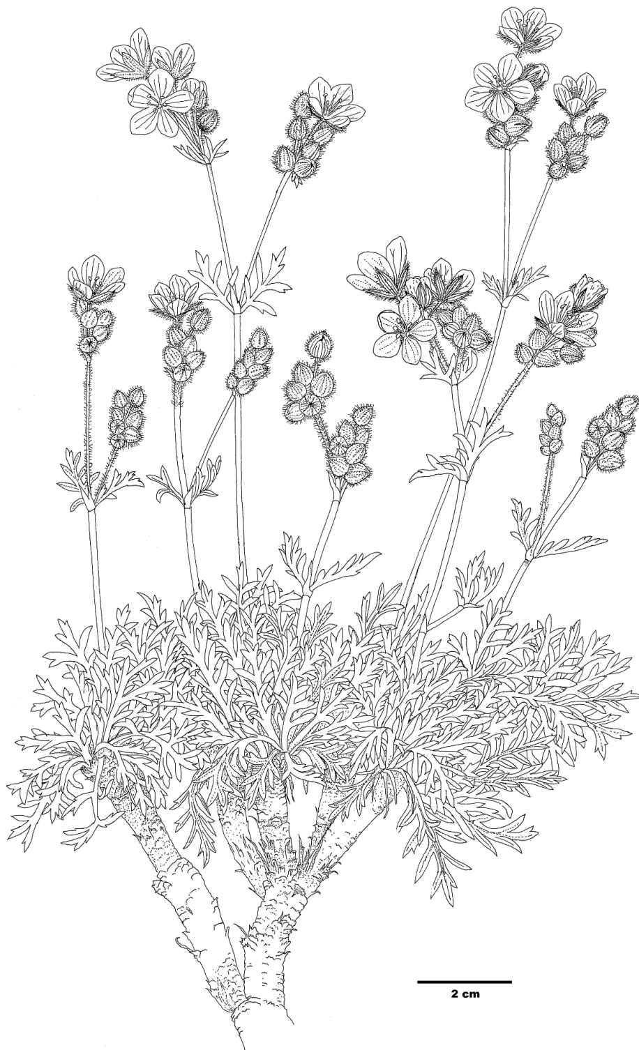
On-line Suppl. Fig. 2. Drawing of Erodium somanum male plant.