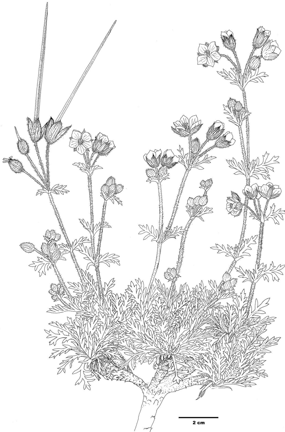
On-line Suppl. Fig. 1. Drawing of Erodium somanum female plant.