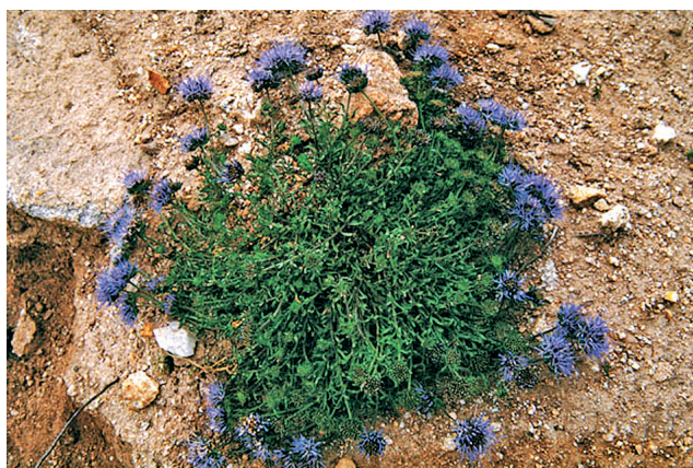
Fig. 1. Habit of Jasione supina Sieber subsp. supina (Campanulaceae).

ing to Campanulaceae has attracted well-informed discussion (Koutsovoulou et al. 2014), studies regarding the germination requirements on the genus Jasione are less worthy of attention. A consideration of seed germination requirements for Jasione shows that the seeds of J. montana , J. heilreichii , J. montana subsp. montana , and J. orbiculata are light-germinating and non-dormant (Pegtel 1988, Peco et al. 2006, Koutsovoulou et al. 2014). It has been found that Jasione cavanillesii has a low germination percentage in light and is considered to be dormant (Fernández-Pascual et al. 2017).