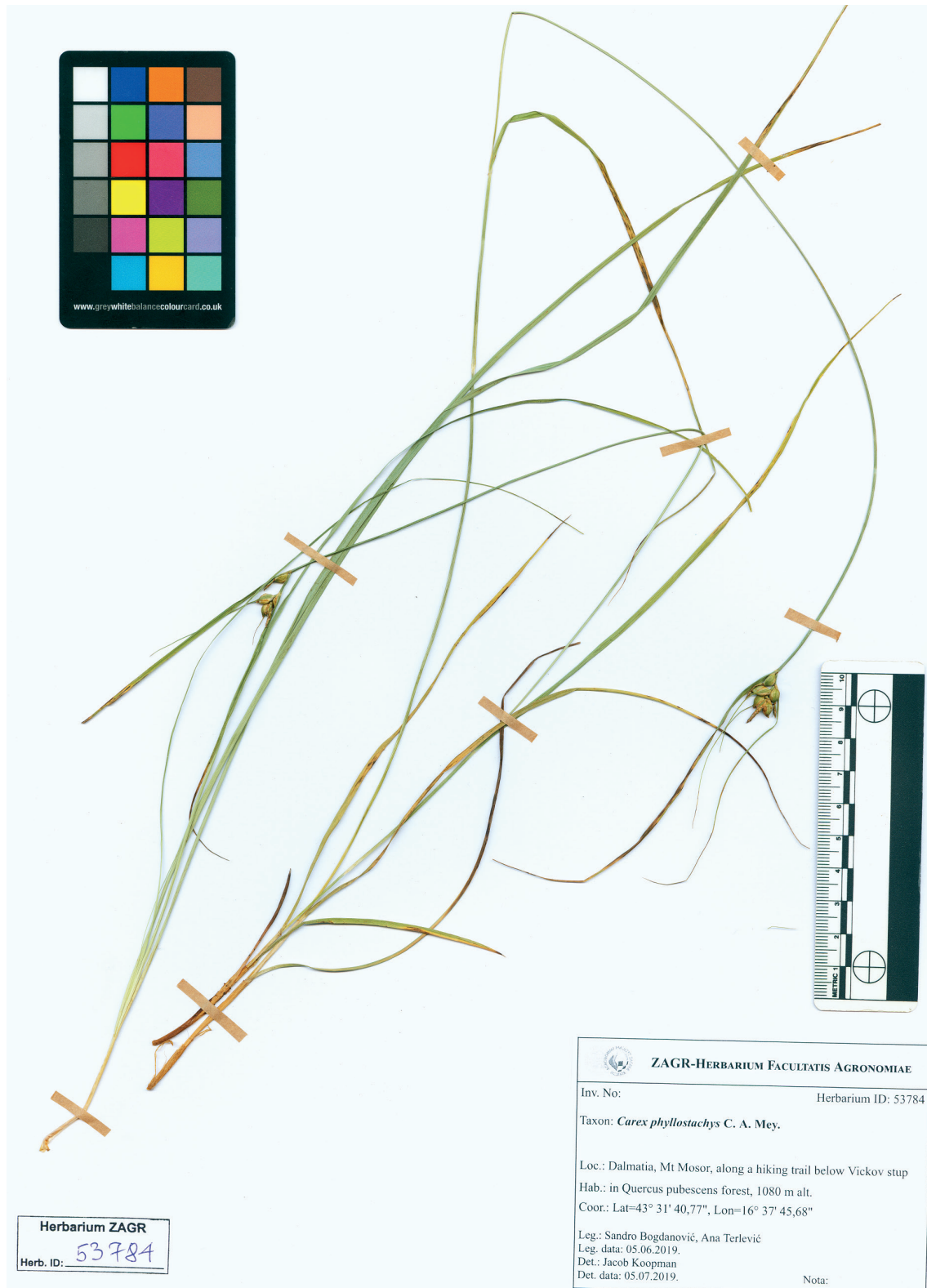
Fig. 2. Herbarium specimen of Carex phyllostachys C.A.Mey. collected on Mt Mosor in 2019 (ZAGR-53784).

sein” (could be), which has later been crossed out. We studied the scanned material from FR herbarium, and according to our opinion this material from Croatia clearly does not belong to C. phyllostachys . There are too many female flowers, and they have normal female glumes, which are missing in C. phyllostachys . This specimen has only one, a bit longer bract, and in our opinion it clearly belongs to the much more com-