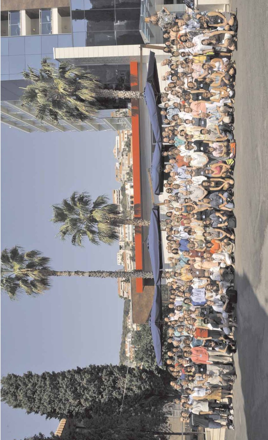
Fig. 1. Participants of the 20 th International Diatom Symposium.