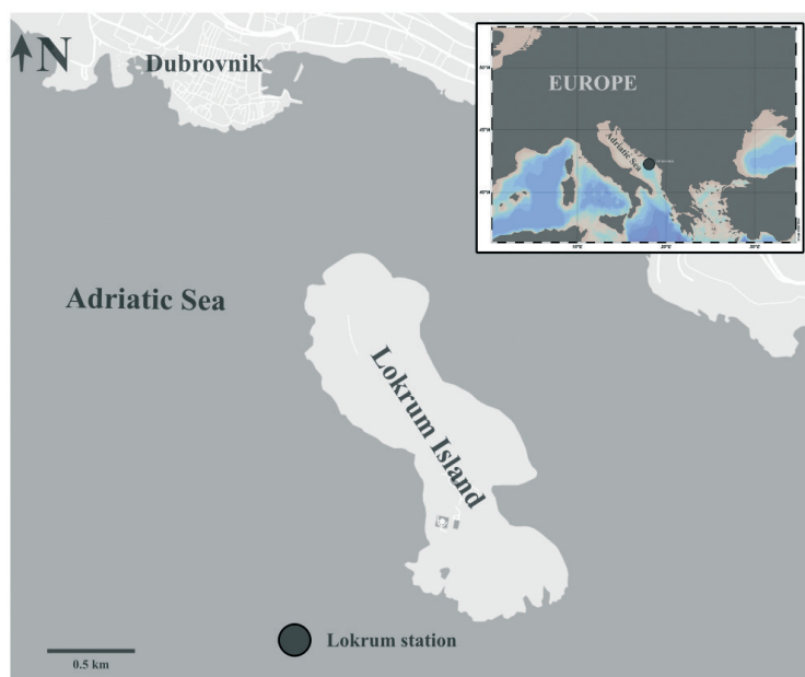
Fig. 1. Position of the coastal Lokrum station in the southern Adriatic Sea, where the dinoflagellate species Tripes rotundatus (Jørgensen) Gómez was found, 17 th July 2021 (derived and adapted from Google earth).