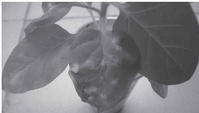
Fig. 2. Virusinoculated tobacco ( Nicotiana tabacum L. 'Samsun') showing local necrotic spots on leaves, characteristic of CMV infection.

weed samples were collected from pepper fields. Of the samples tested, 7.7% were found to be infected with CMV. CMV was found to be the virus most frequently detected, in 13 weed species out of 24 species (ARLI-SOKMEN et al. 2005). In experimental work, the virus is most frequently transmitted mechanically, and sap, purified virions, and viral RNA are all infectious via mechanical transmission (ROOSSINCK 2001). In addition, DHEEPA and PARANJOTHI (2010) reported that CMV from banana could be transmitted by rhizome inoculation and mechanical methods. To help prevent CMV from spreading, farmers are recommended to remove any mint plants infected with CMV near springs.