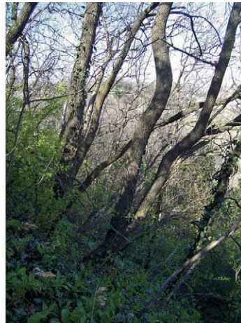
Fig. 2. and 3. Flowering Vinca herbacea and its habitat on Bansko Hill, near Zmajevac