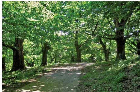
Fig. 2. The open structure of the chestnut stands originates from plantation for crop production and results in a rather irregular canopy.