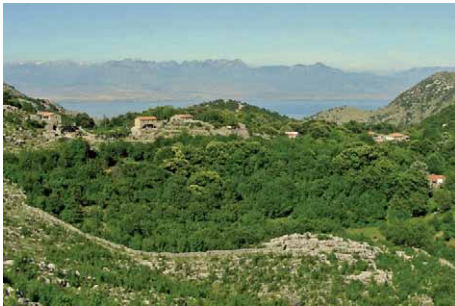
Fig. 1. The investigated locality is situated in the small rural settlement called Gornja Briska, 1.5 km southeast of the village Livari. Background: Lake Skutari and Albanian Alps.

The open structure of the chestnut stands (Fig. 2) originates from plantation for crop production and results in a rather irregular canopy.