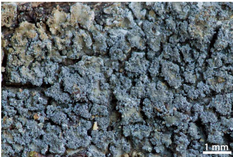
Fig. 4. Fuscopannaria mediterranea (Mayrhofer 18438), a species rare in Montenegro.

roadside Morus alba . The list presented is based on collections made by the first author in 2004 and supplemented with studies by the first and second author in 2009. The specimens have been identified with the aid of POELT (1969), POELT and VĚZDA (1977, 1981), CLAUZADE and ROUX (1985) and WIRTH (1995). Some of the identifications required verification using standardized thin-layer chromatography (TLC) following the protocols of